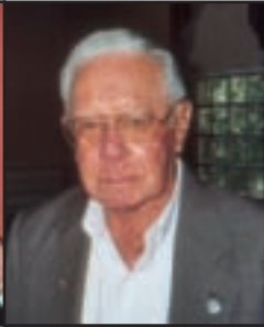
Grady Cooper Sapphire Club